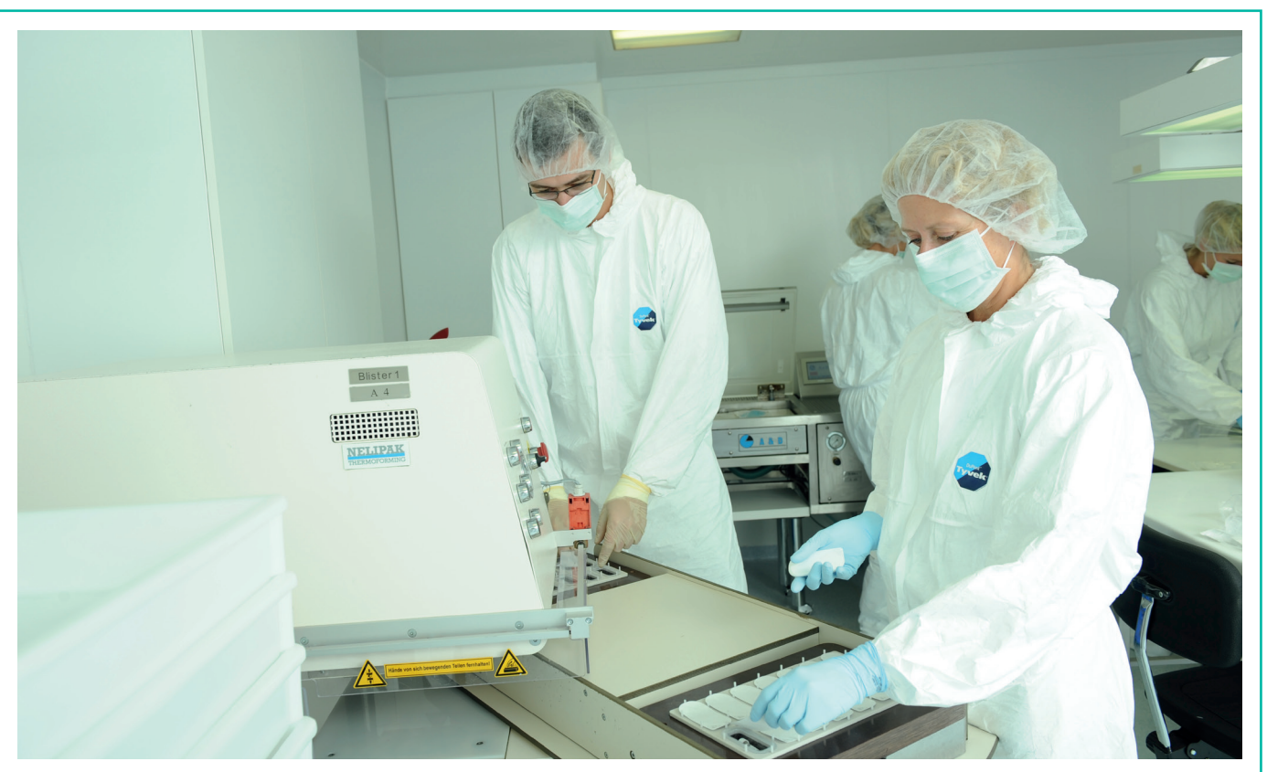
Cleanroom packaging at DOT