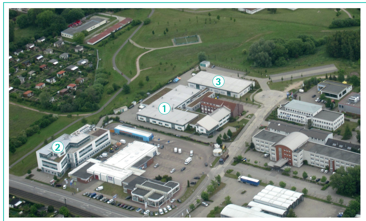
Our location in Rostock with 3 buildings