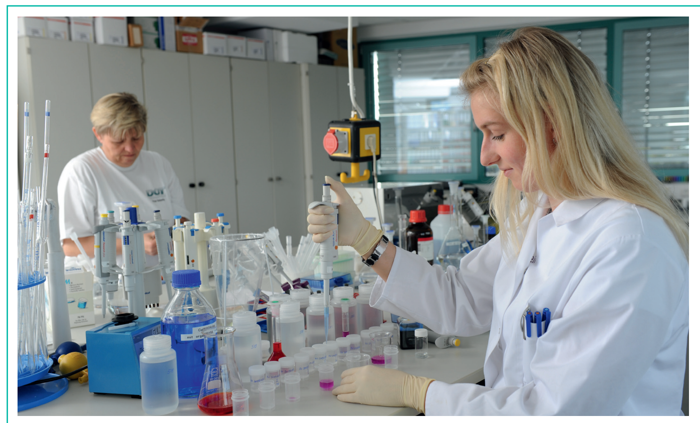
Laboratory services at DOT